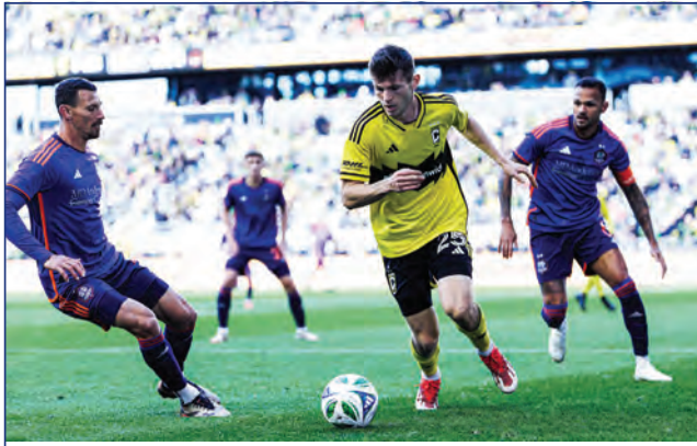
The Crew drew 0-0 against Houston Dynamo FC in Saturday's match at Lower.com Field on March 8, 2025.