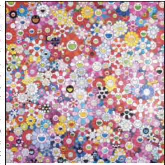
Shangri-La Pink , 2012. Takashi Murakami. Acrylic on canvas on aluminum frame; 200 x 200 cm. © 2012 Takashi Murakami / Kikai Kiki Co. Ltd. All rights reserved.

In addition to works more than 30 feet wide on view, the centerpiece of the exhibition is the re-creation of the Yumedono, or Dream Hall, from Nara's Horyuji Temple complex in the CMA's magnificent atrium. Visitors can enter Murakami's rendering of the Yumedono to experience four new paintings by the artist that the structure was designed to house. The interpretation of this exhibition at the CMA also includes new artworks from Murakami placed in conversation with works in the museum's permanent collection galleries, meant to provide helpful context and to spark emotional