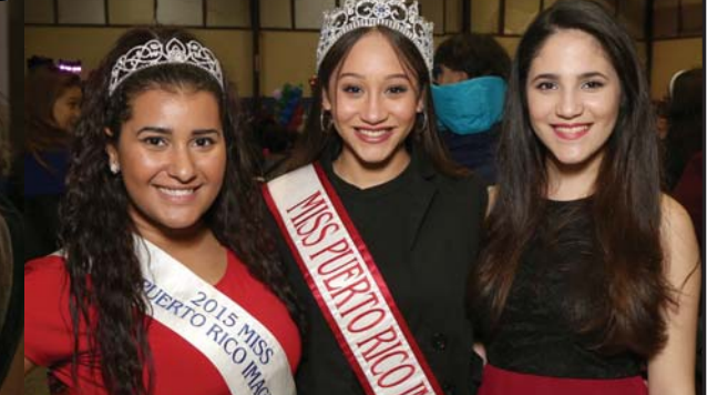
City of Cleveland hosts 8th annual El Día de Los Reyes - Three Kings Fiesta January 8, 2016