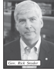
Gov. Rick Snyder