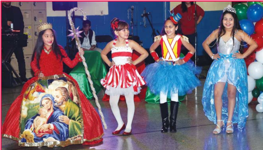
City of Cleveland hosts 8th annual El Día de Los Reyes - Three Kings Fiesta, Page 9.