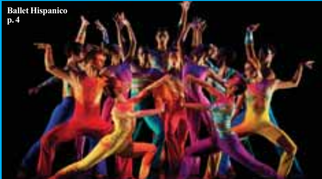
Ballet Hispanico p. 4