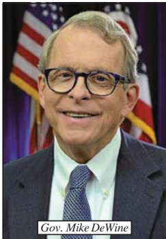
Gov. Mike DeWine

VACCINE DATA COLLECTION: DeWine has been asking vaccine providers to collect and report accurate and complete