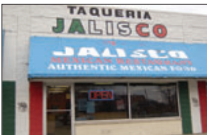
Taquería Jalisco, Toledo OH; Open 7 Days a week. Abierto 7 días a la semana. 419.944.6808.

Provide end-user technical support, assistance, training and documentation on network, computer, software, phone, copiers and application usage. Responsible for workstation imaging and installation, including installation and repair of computer hardware & software. Full job description at www.toledomuseum.org. Requires associates degree or equivalent combination of education and experience and 3 years in PC technical support role with hardware and software troubleshooting and management skills and techniques; workstation and hardware installation and support, including workstation imaging techniques; and excellent customer service skills. Strong knowledge of MS Office, with ability to teach, and prior experience setting up and delivering computer training to users. A+/Microsoft certifications a plus. To apply, e-mail resúme with cover letter to jobs@toledomuseum.org or mail to HR, Toledo Museum of Art, PO Box 1013, Toledo, OH 43697. EOE.