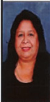
Teledo Ohio Region