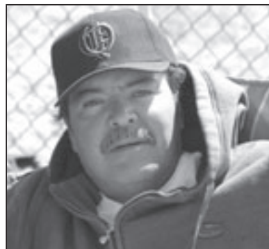
Me gusta fútbol!

Dep. Las Lajas 0 vs. Dep. Holanda 9 Monaco 2 vs. Atl. Cobras 4 Atl. San Pancho 2 vs. Falcons 3 Central Arsenal 0 vs. Guadalupe 0 Michigan 4 vs. Internationals 3