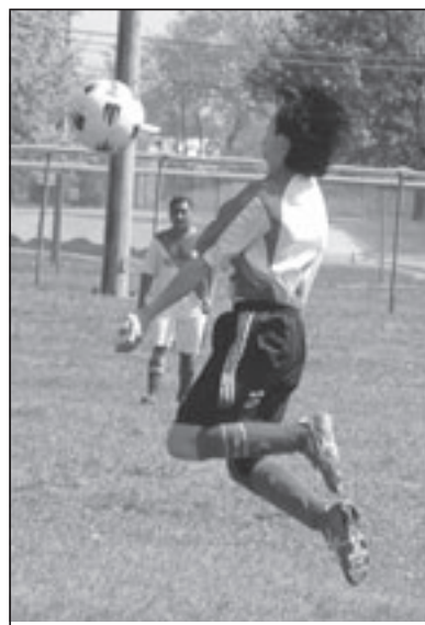
Atl. Cobras 4, Monaco 2

After 2 weeks, Dep. Holanda and Falcons are tied for first place with 2 wins and 6 points each. Guadalupe is 1-1, with 4 points and At. San Pancho, Michigan, Atl. Cobras, and Dep. Las Lajas are 1-1, with 3 points each. Central Arsenal, Monaco, and Internationals are 0-2.