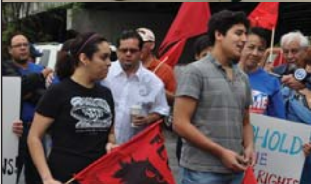
¡REPUDIO! Marchas en 70 ciudades en contra de la "Ley Arizona" y a favor de una reforma migratoria; página 4 (LC1-4).