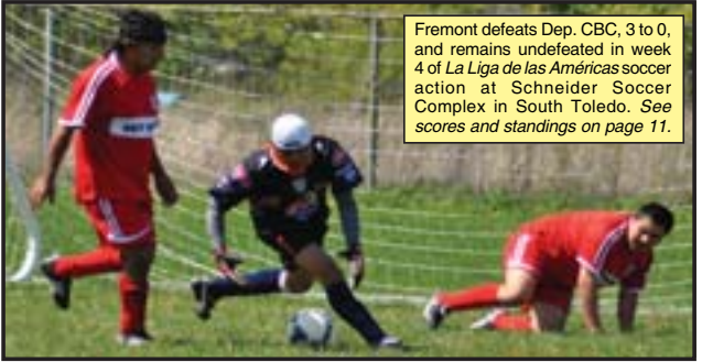
Fremont defeats Dep. CBC, 3 to 0, and remains undefeated in week 4 of La Liga de las Americas soccer action at Schneider Soccer Complex in South Toledo. See scores and standings on page 11.