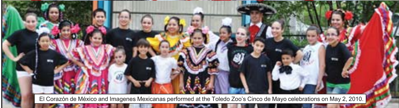
El Corazón de México and Imagenes Mexicanas performed at the Toledo Zoo's Cinco de Mayo celebrations on May 2, 2010.