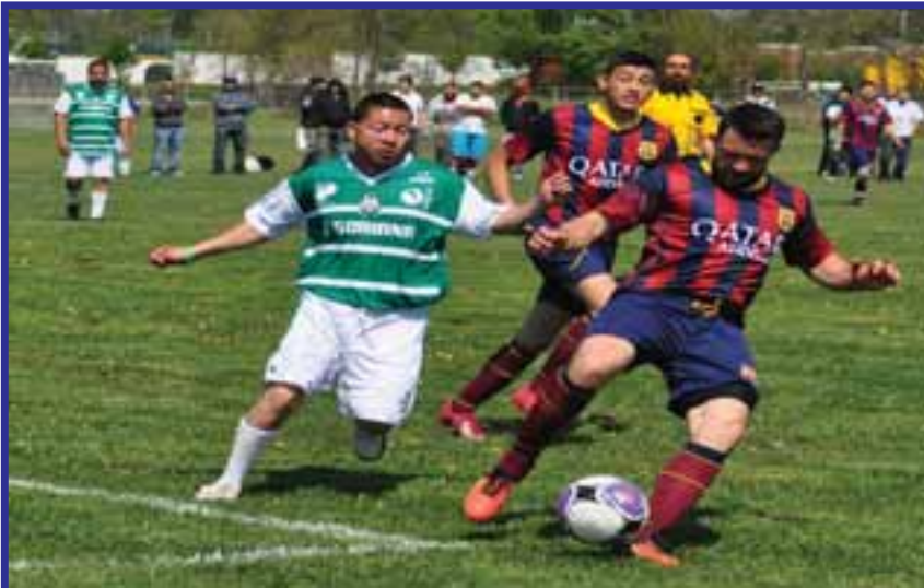
La Liga de las Américas Soccer Season Begins, page 13

Nashville Office: By Appointment Only 301 S. Perimeter Park Dr., Suite 100, Nashville, TN 37211 Phone: (615) 833-2206