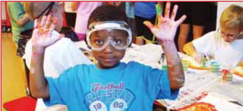
Prevent Brain Drain with Imagination Station's Summer Camps, page 11