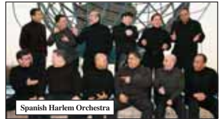
Spanish Harlem Orchestra

Friday, July 4, 5 pm Power Center $55, $50, $45, $40 US-America's funniest politicians make their annual return to the Power Center for one show only! These former Congressional staffers poke fun at both sides of the aisle with their own special brand of satirical humor and up-to-the-minute song parodies. If you're tired of hearing about Congressional gridlock, financial crises, or sex scandals, you've come to the wrong place.