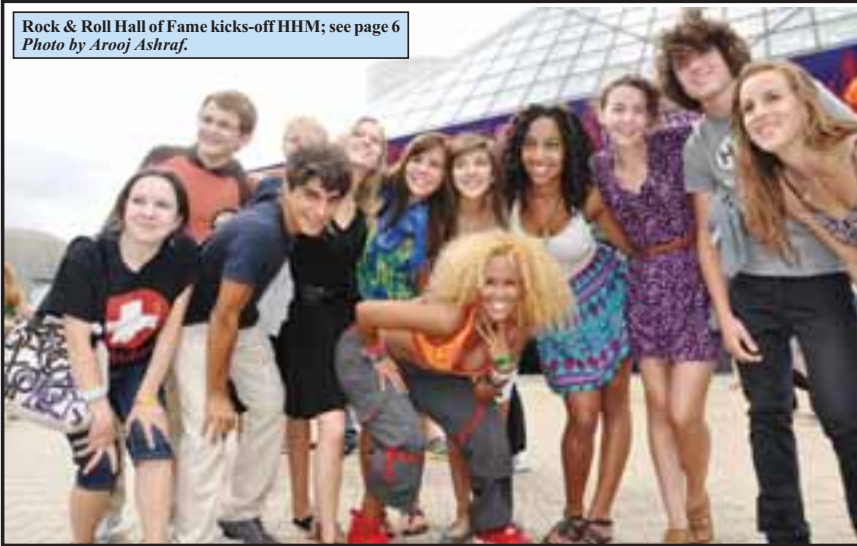
Rock & Roll Hall of Fame kicks-off HHM; see page 6