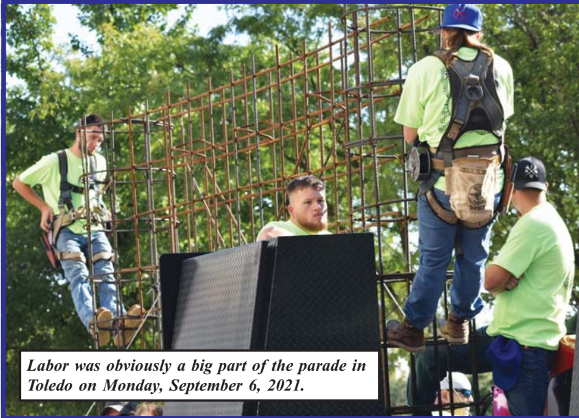
Labor was obviously a big part of the parade in Toledo on Monday, September 6, 2021.