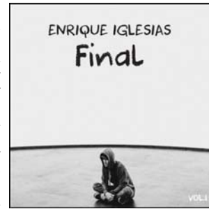
ENRIQUE IGLESIAS Final

Grammy y cinco Latin Grammy. "Nunca voy a dejar de hacer música, nunca voy a dejar de escribir canciones porque me encanta escribir canciones, pero lo voy a hacer de una forma diferente, lo que significa que no necesariamente tienen que ser en un paquete como álbum", señaló Iglesias mientras que agregó con humor: "No tengo la velocidad que tú tienes Sebastián para escribir una canción y ese mismo día grabar el video. Desearía ser tan rápido". "Enrique Iglesias & Ricky Martin Tour" es la primera gira conjunta de Iglesias y Martin. Se aplazó en 2020 debido a la pandemia y finalmente la comenzarán, con Yatra como telonero, el 25 de septiembre en el MGM Grand Garden Arena de Las Vegas. El recorrido terminaría el 20