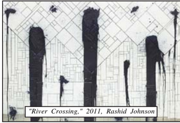
“River Crossing,” 2011, Rashid Johnson

This installation includes approximately 25 works, including recently acquired objects that have never, or rarely been seen by the public by artists such