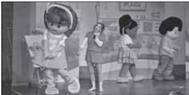
Fisher-Price Little People entertained the Toledo Zoo visitors November 9-10, 2013.