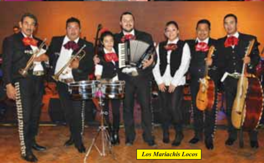
Los Mariachis Locos