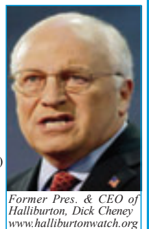
Former Pres. & CEO of Halliburton, Dick Cheney www.halliburtonwatch.org

Through December 20, 2007 U.S. Military Casualties in Iraq: Since War began (3-19-03): 3,896 dead Since "Mission Accomplished" speech by Pres. George W. Bush (5-1-03): 3,756 dead Since capture of Saddam (12-13-03): 3,435 dead Since U.S. handover to Iraq (6-29-04): 3,037 dead Since Iraqi election (1-31-05): 2,458 dead Since Saddam's Execution (12-30-06): 898 dead U.S. Wounded: 28,629 (official reported count) Iraqi death toll: Est. 200,000 to 1,000,000 Average Per Diem Cost: $400 million per day Bush's 2007 estimate of duration of War: 50+ years U.S. Military Deaths in Afghanistan: 473 dead [Sources: www.antiwar.com and www.costofwar.com ]