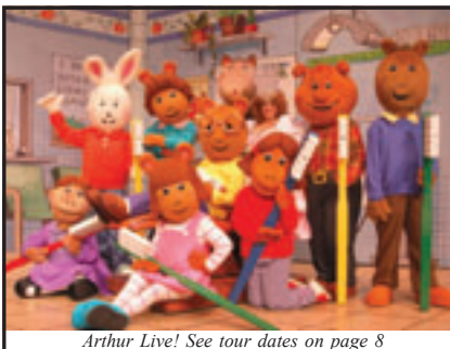
Arthur Live! See tour dates on page 8