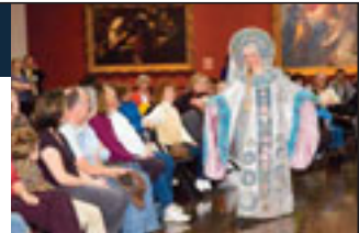
Explore the traditions of three cultures during Winter Legacies.

Guided Tour: Greek Art 12:30 P.M., Meet in Libbey Court