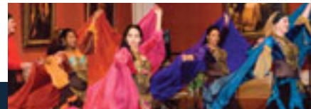
Vibrant costumes and vivacious moves make the dancers of Leyla and Lapis Lazuli a hit with audiences of all ages.

Beautiful works of art are often created to address everyday challenges, such as ancient Greek vases for storing and carrying liquids. Create a similar vessel with clay.