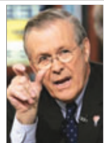
S of D Don Rumsfeld

Through February 6, 2006 U.S. Military Casualties in Iraq: Since War began (3-19-03): 2,252 dead Since "Mission Accomplished" speech by Pres. George W. Bush (5-1-03): 2,115 dead Since capture of Saddam (12-13-03): 1,785 dead Since U.S. handover to Iraq (6-29-04): 1,386 dead Since Iraqi election (1-31-05): 816 dead U.S. Wounded: 16,549 (official count) Iraqi death toll: Est. 30,000-100,000 Average Per Diem Cost of War: $300 Million per day Rumsfeld's '05 estimate of duration of War: 12 years [Source: www.antiwar.com]