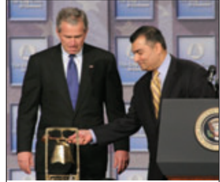
Who took the Gong?

It is heard every Friday on the live radio broadcasts of City Club Forums on WCLV-FM and on The City Club's radio network, which includes more than 200 stations across the country. In addition, viewers see it every week