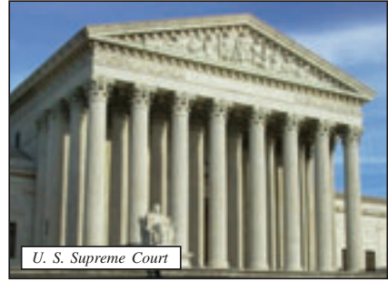
U. S. Supreme Court