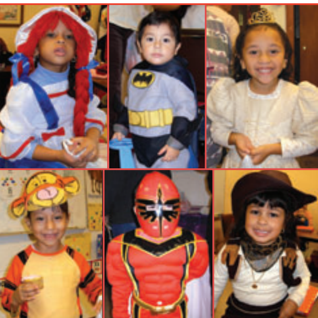
Adelante's Leamos Juntos serves a need for preschoolers, p. 6