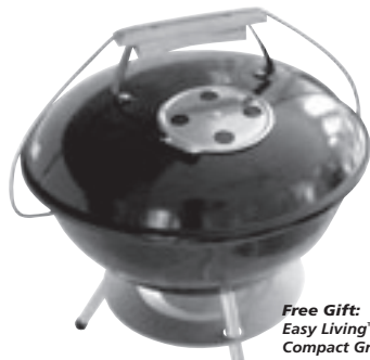
Free Gift: Easy Living™ Compact Grill