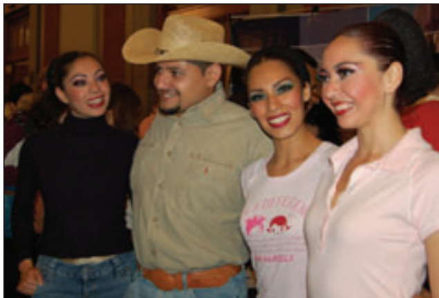
A Tejano mingles with members of the Amalia Hernández's Ballet Folklórico de México, from México D.F., which performed last week in Ann Arbor.