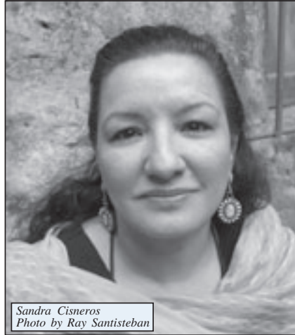
Sandra Cisneros

Ann Arbor: The kaleidoscope of U.S. Latino identity includes people from 20 countries, different ethnicities, religions, distinct accents, and who speak a mix of Spanish Portuguese and English. This complexity will be explored in the University of Michigan keynote address for Hispanic Heritage Month by writer and poet