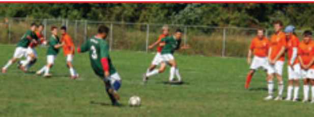
La Liga de Las Américas: Dep. Holanda defeats El Tri in overtime, 3 to 2, last Sunday at Schneider Soccer Complex. Championship playoffs next Sunday, Oct. 1, 2006, at Bowsher High School, 3548 S. Detroit Ave., Toledo. See page 11.

escritora, explica así el título provocador de su conferencia: "Es el Mes de la Hispanidad, pero jamás (Continúa en la p. 4)