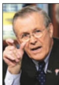
S of D Don Rumsfeld