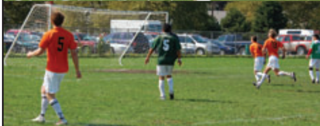
Central Arsenal defeats Toledo Sports Club 3 to 2 (top photo) and Dep. Holanda defeats El Tri 3 to 2 in OT last Sunday; championship is on Oct. 1 at Bowsher HS.