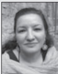
Sandra Cisneros

A FLOC Victory Banquet begins at 7:00PM at SeaGate, with guest speaker Sandra Cisneros.