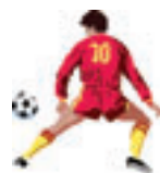
colero América de Cali.

Cali empató 0-0 en casa frente al Huila y el Cúcuta por su parte venció 2-0 al