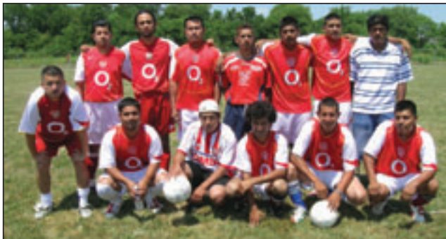
Central de La Liga de Las Americas