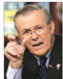
S of D Don Rumsfeld

Through July 8, 2004 U.S. Military Casualties in Iraq: Since war began (3-19-03): 1,7525 dead Since "Mission Accomplished" speech by George W. Bush (5-1-03): 1,615 dead Since capture of Saddam (12-13-03): 1,285 dead Since U.S. handover to Iraq (6-29-04): 886 dead Since election (1-31-05): 320 dead U.S. Wounded: 13,190 (official count; est: 15-38,000) Iraqi death toll: Est. 100,000 Rumsfeld's estimate of duration of war: 12 more years [Source: www.antiwar.com]