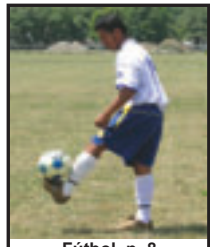
Fútbol, p. 8