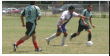
Gama defeats Fostoria, 2-1.