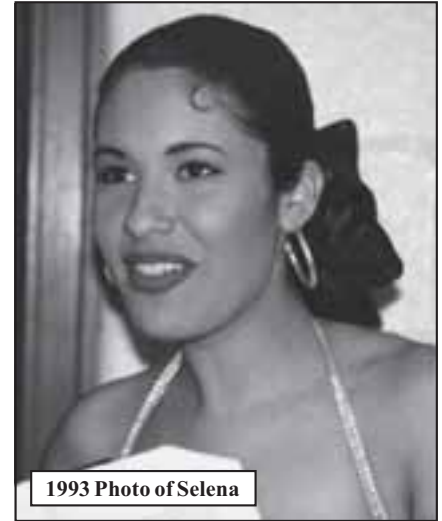
1993 Photo of Selena