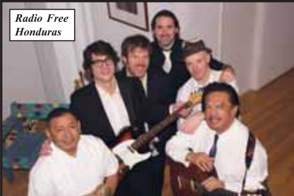
Radio Free Honduras

Source: Michigan Department of Licensing and Regulatory Affairs, P.O. Box 30004, Ottawa Bldg. 4 th Floor, Lansing, MI 48909. LARA es un empleador/programa que proporciona igualdad de oportunidades.