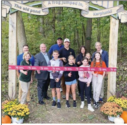
ODNR celebrated the opening of a new Haiku Trail at Van Buren State Park with a ribbon-cutting ceremony.

The new haiku trail features 20 poems along the Van Buren State Park's current Lakeshore Trail, a 0.5-mile path with views of Van Buren Lake. Benches are situated along the trail so hikers can reflect upon the featured poems and find inspiration from nature. The 20 haikus that were selected were chosen from over 150 haikus written by those local to the park's area. "This is a perfect combination of community passion and appreciating natural all