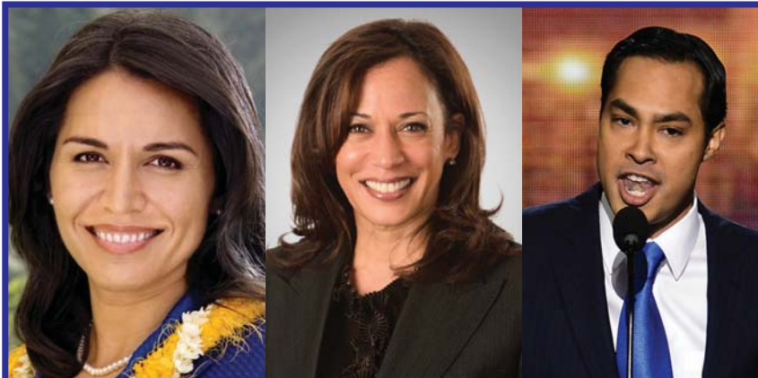
Rep. Gabbard, Sen. Harris, & Castro: Minorities announce candidacy for President, p. 12