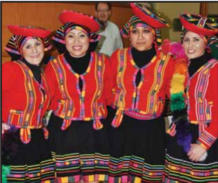
Marcia Salas Dance Group performs at Taste of Perú. See page 11.