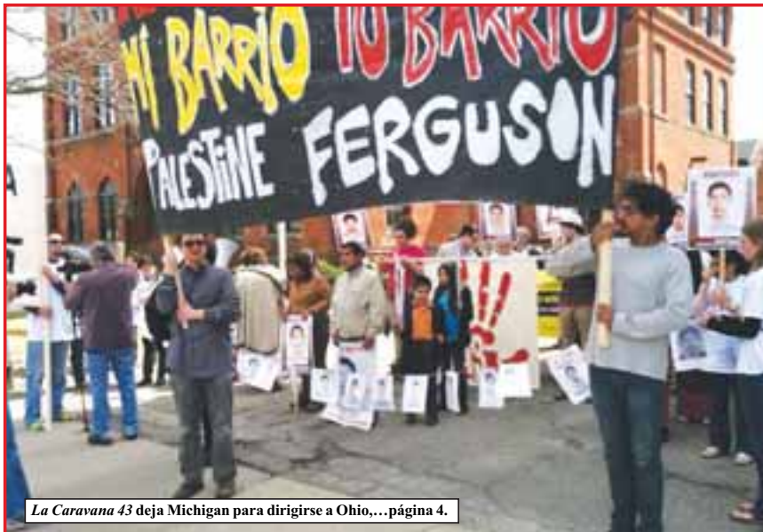
La Caravana 43 deja Michigan para dirigirse a Ohio,...página 4.

LORAIN PUBLIC LIBRARY SYSTEM COMMUNITY SURVEY April 17, 2015: What do you think of your neighborhood library? The Lorain Public Library System would like to hear from you as they plan for the future. They're working on a strategic plan that will guide their services in the years to come. Help them continue to evolve as 21 st century libraries. Take a few minutes of your valuable time and complete their questionnaire. Visit LorainPublicLibrary.org/Community-Survey and fill out their survey by Friday, April 24. Surveys are also available in each library. Only have time for a quick comment? Leave your thoughts on the following voicemail: 1-800-322-READ (7323), ext. 801. Let the Lorain Public Library System know how you use the library, or tell them why you don't. What would you like to see in the future? Let your voice be heard!