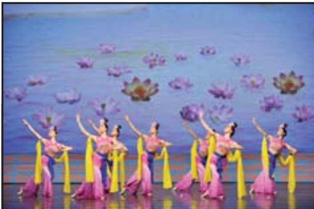
Shen Yun will be at the State Theatre on Saturday, May 29 at 7:30 pm. The Chinese Classical dance troupe is based in New York and spreads the word about Chinese culture and repression by the Chinese government. See related story on page 10.