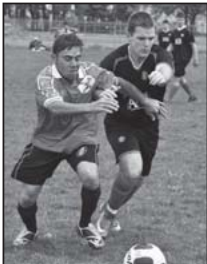
Central Arsenal defeats Manchester, 6 to 1, on 5-16-10