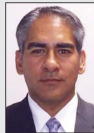
chairman of the Hispanic Roundtable