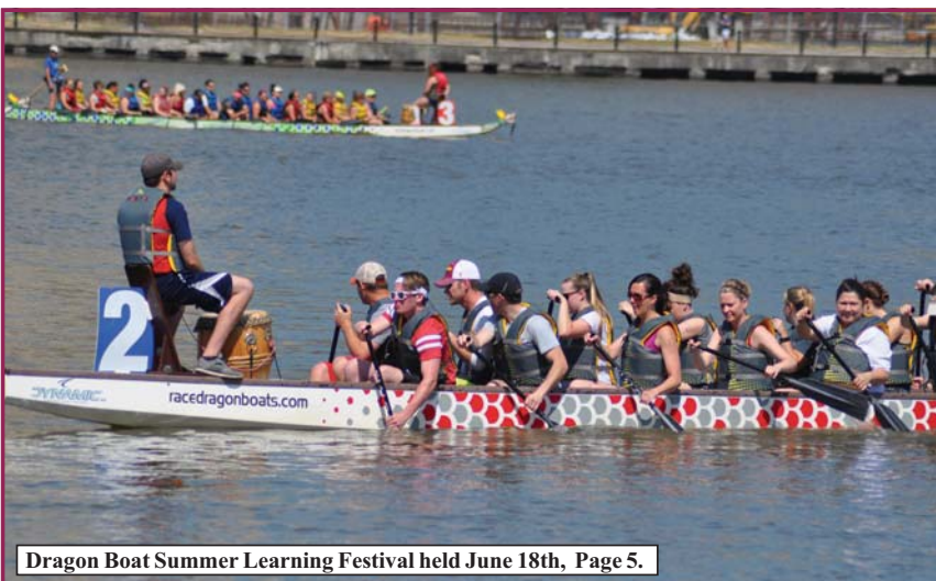
Dragon Boat Summer Learning Festival held June 18th, Page 5.