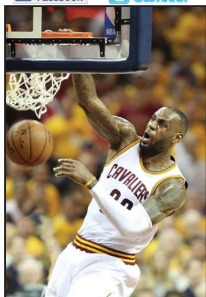
LeBron James wins NBA Finals MVP for 3rd time, Page 16.