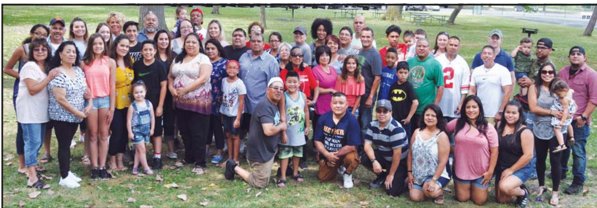
The Torres/De La Cruz/Lara/Aldaco Reunion, July 21, 2018 @ Pearson Park, Oregon, Ohio.