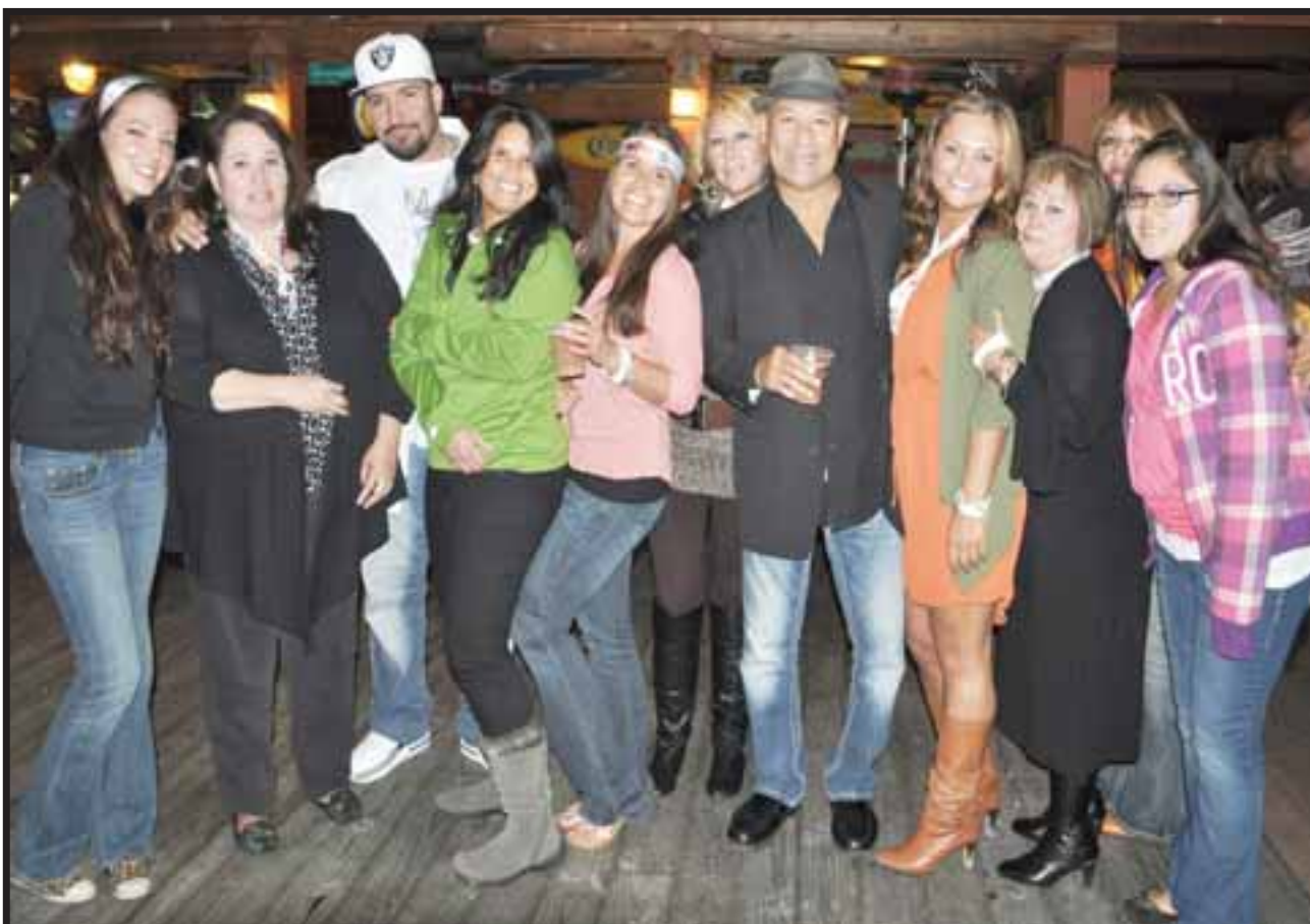
Sept. 16, 2013: El Camino Real Restaurant (West) hosted una gran gala for Mexican Independence Day and La Prensa's 25 th Anniversary.