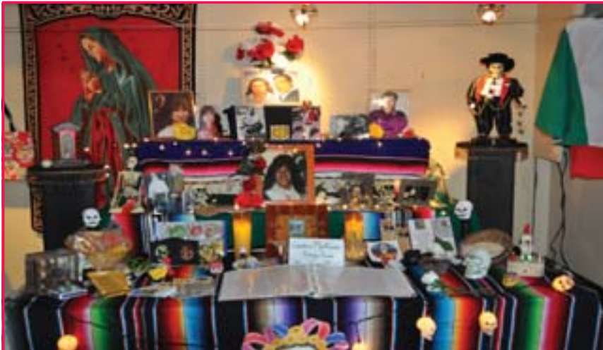
Día de los Muertos celebrated at Sofia Quintero Art & Cultural Center on Nov. 6, page 5.

Sofia Quintero Art & Cultural Center's Milva Valenzuela Wagner and Dora López greet guests at el Día de los Muertos remembrances on Nov. 6, 2010. See page 5.