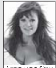
Nominee Jenni Rivera