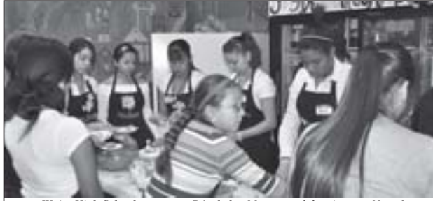
Waite High School servers at Día de los Muertos celebrations on Nov. 6