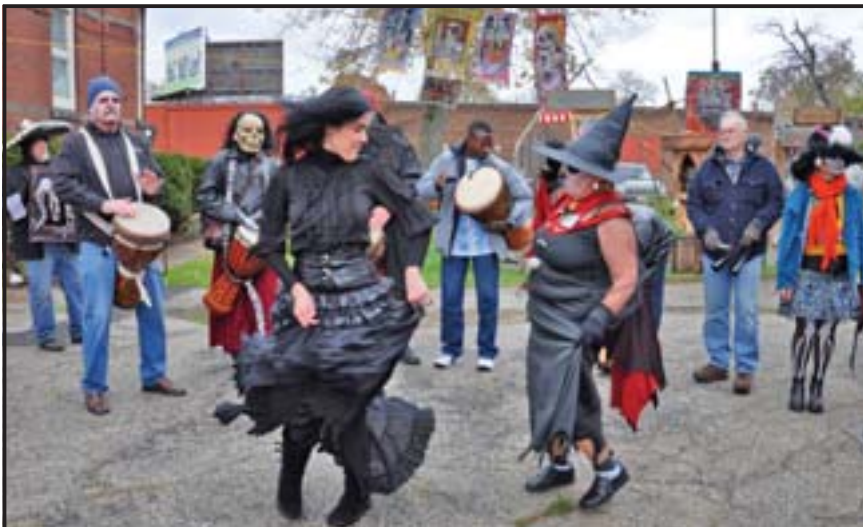
Day of the Dead revitalizes culture at Gordon Square. page 16

EL CENTRO HOSTS ITS VENETIAN MASQUERADE, Page 7