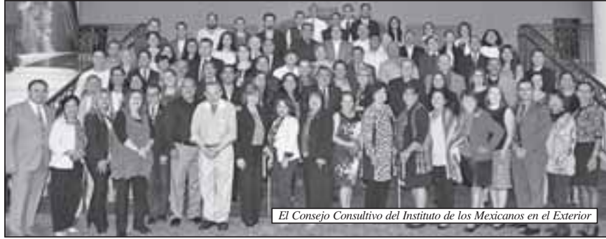
El Consejo Consultivo del Instituto de los Mexicanos en el Exterior