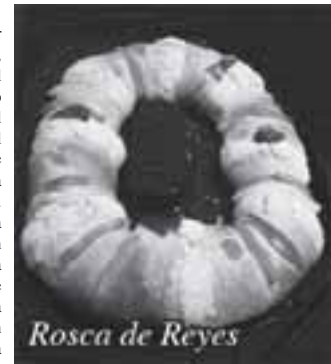
Rosca de Reyes

bendecir a la iglesia el 2 de febrero, Día de la Candelaria , además de ofrecer tamales y atole.